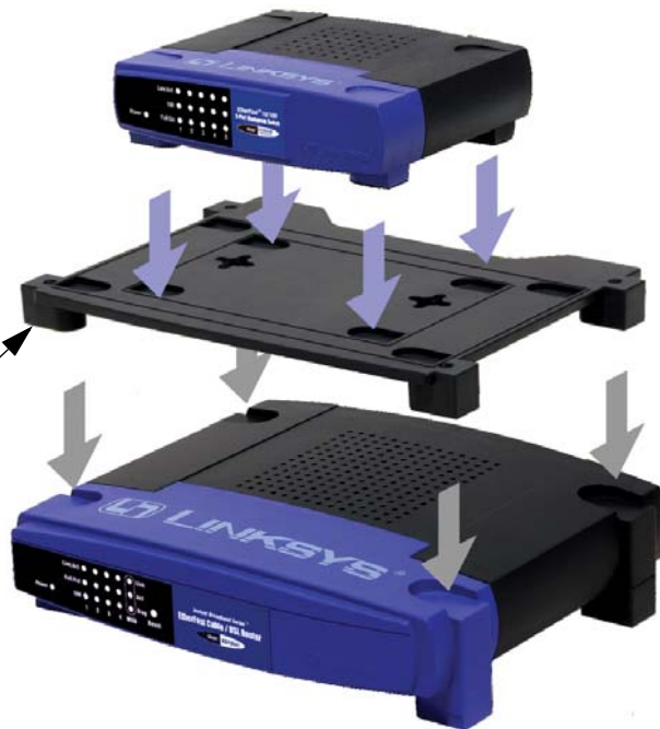
Figure 2: Stacking