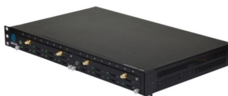
DWG2000F-16G/C-M (Built in 4-1 Antenna Power Divider )