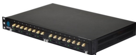
DWG2000F-16G/C (Standalone Antennas )